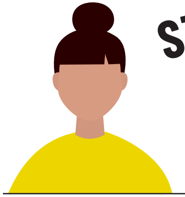
Wei from China